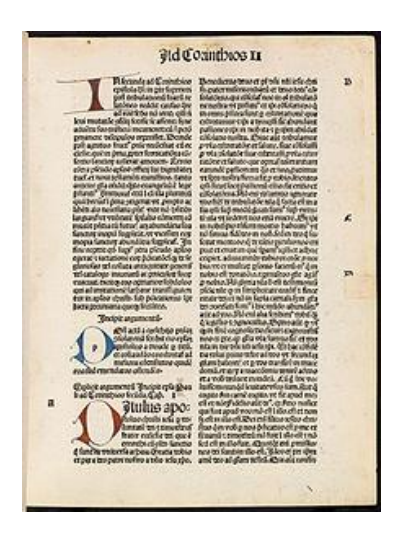
II Corinthians from a 1486 Latin Bible